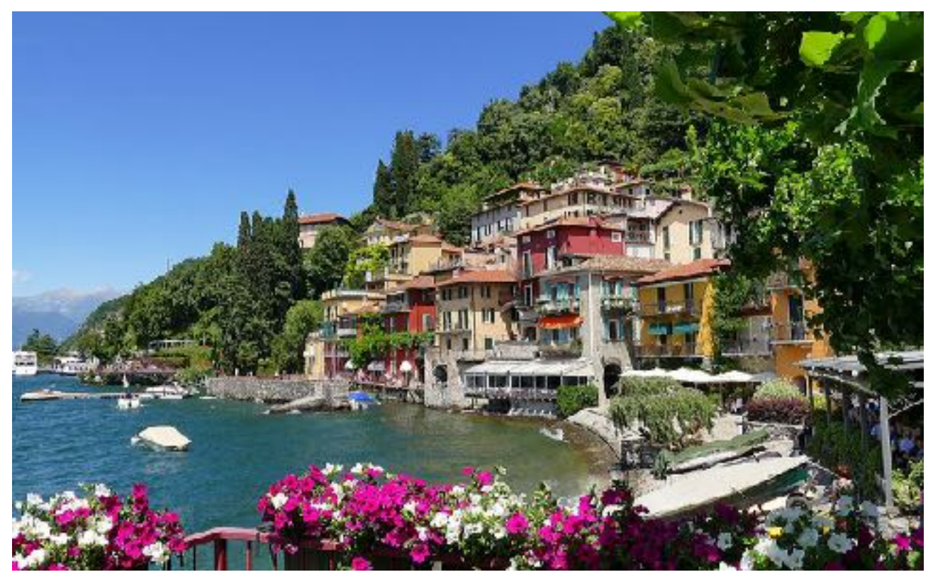
RELATED Italian Villa with views of Lake Como

There's something quite charming about Argegno's unique layout, with houses steadily climbing the slope of the mountainous region behind the waterfront. It might only be a small village, but it's packed with charm and character, which makes it an excellent destination to get involved with the beauty and magic of Lake Como. It also has its own small harbour, which, though lacking a little in size, is wonderfully quaint and feels quintessentially Italian .