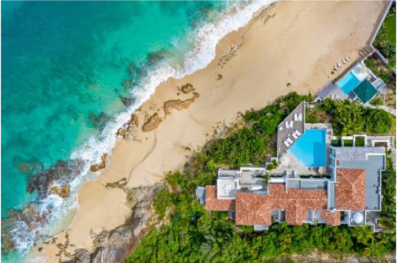
Villa C'est la vie

Nestled at the edge of a forest of palm trees, along the fine sandy beach of Baie aux Prunes, the <u>villa</u> <u>C'est la vie</u> amazes us with its modern Creole architecture and its astonishing shapes. Stroll with the