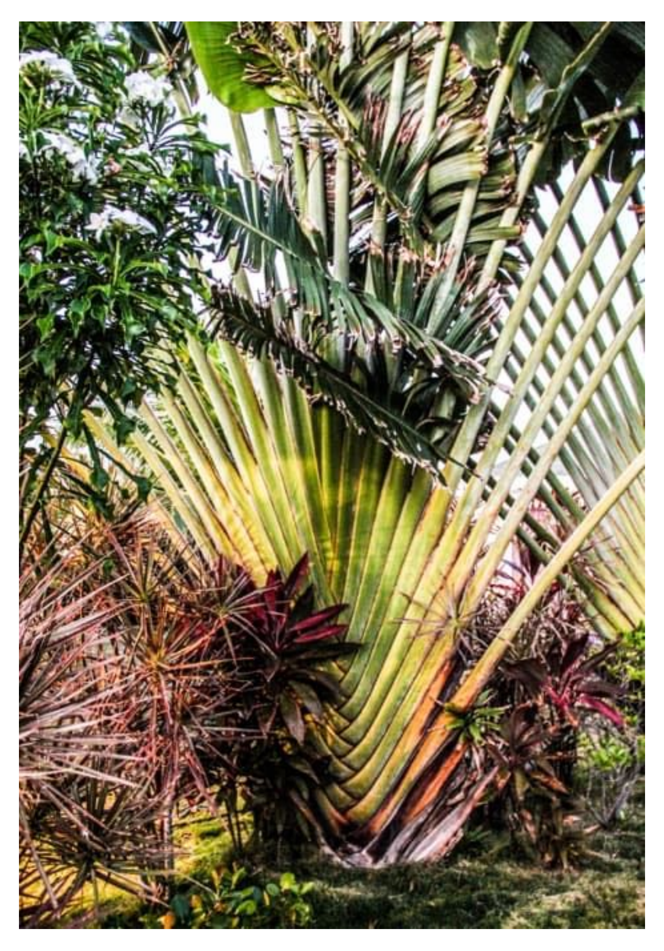
Tour the towns for Saint-Martin