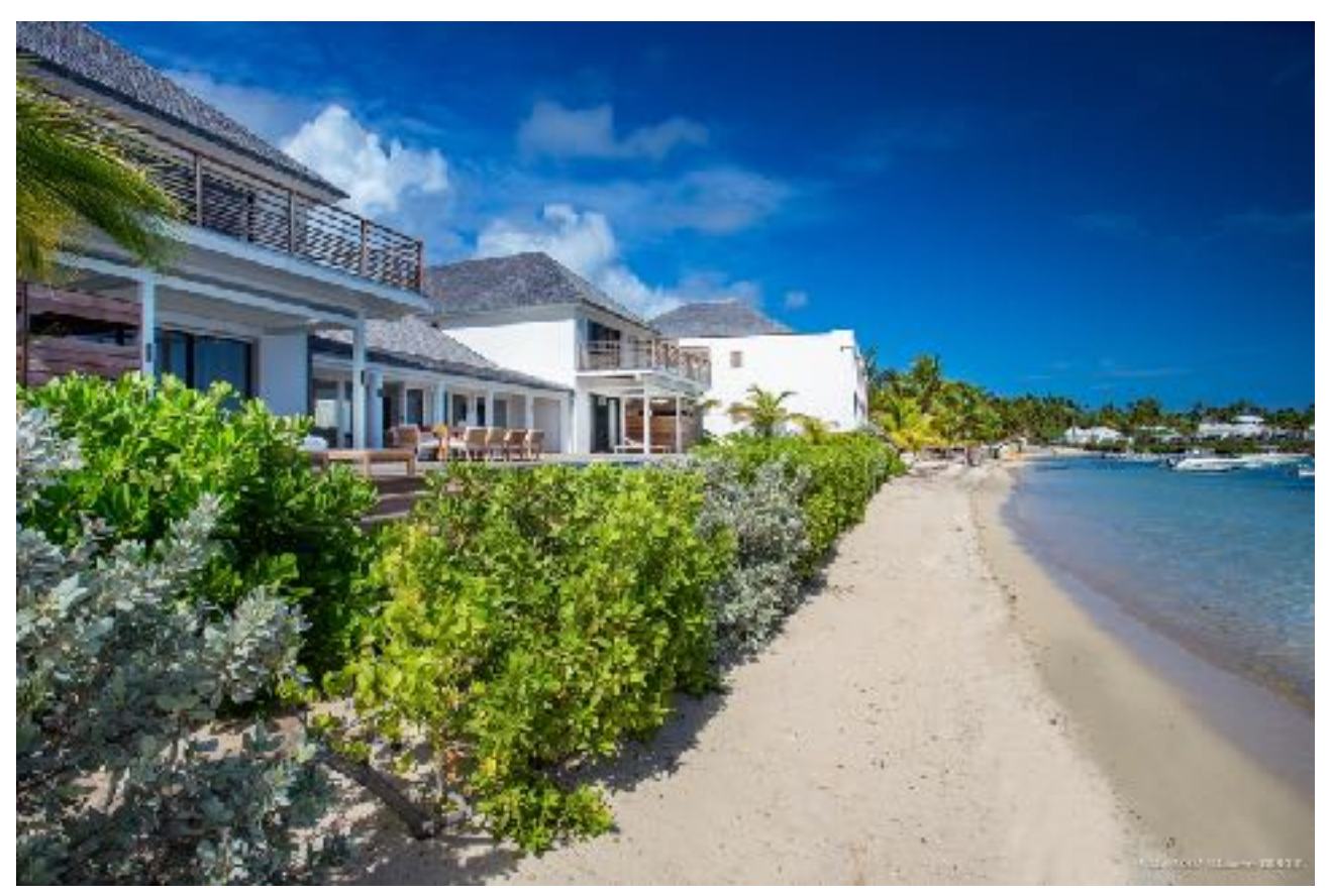
Bleu | St Barts Villas | Haute Retreats[/caption] Villa Wake Up

This luxury villa, located just above the edge of Flamands Beach in <u>St. Barths</u>, is an amazing six bedroom property for rent that features instant beach access and unique ocean views. What we believe is Haute about this villa is the high level of privacy and the wonderful location.