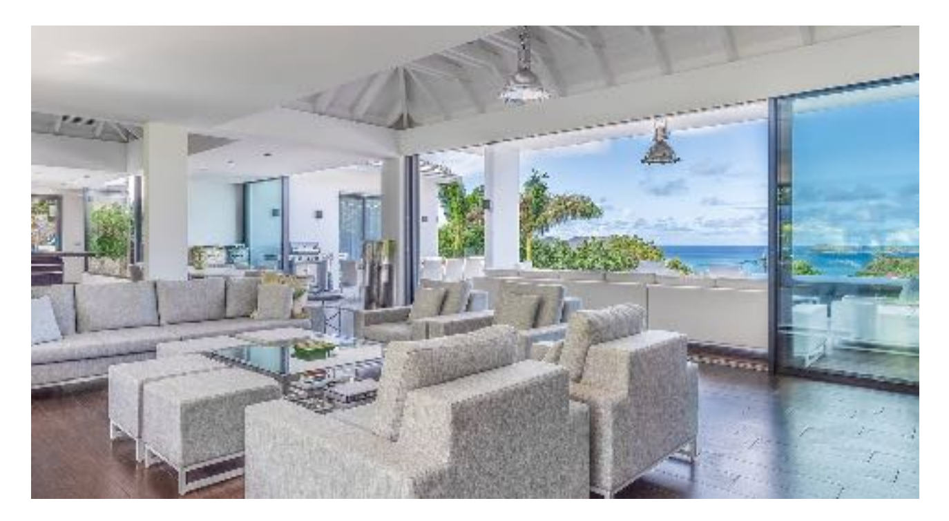
RELATED The Best Restaurants of St. Barts: Insider's Guide