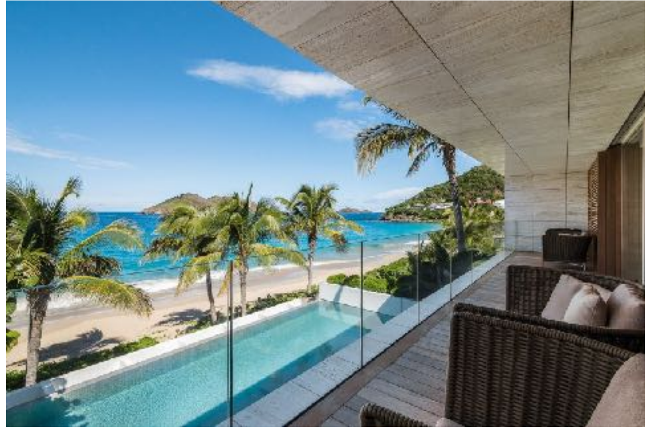
Villa Wake Up | St Barts Villas | Haute Retreats[/caption]