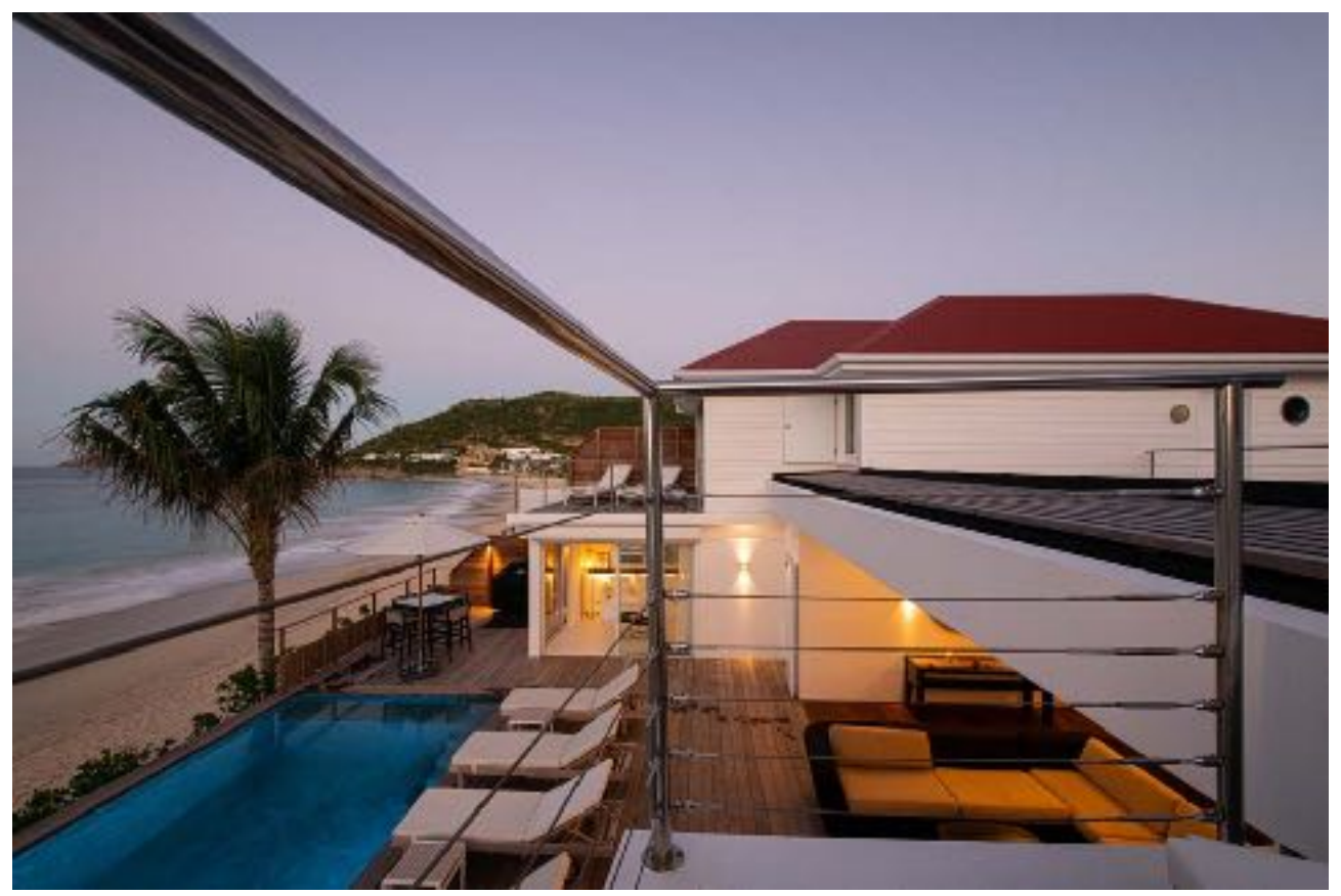
Maison de La Mer | 7 BR | St Barts Villas | Haute Retreats