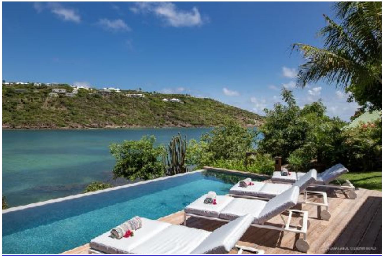
Javacanou | 3 BR | St Barts Villas | Haute Retreats[/caption]