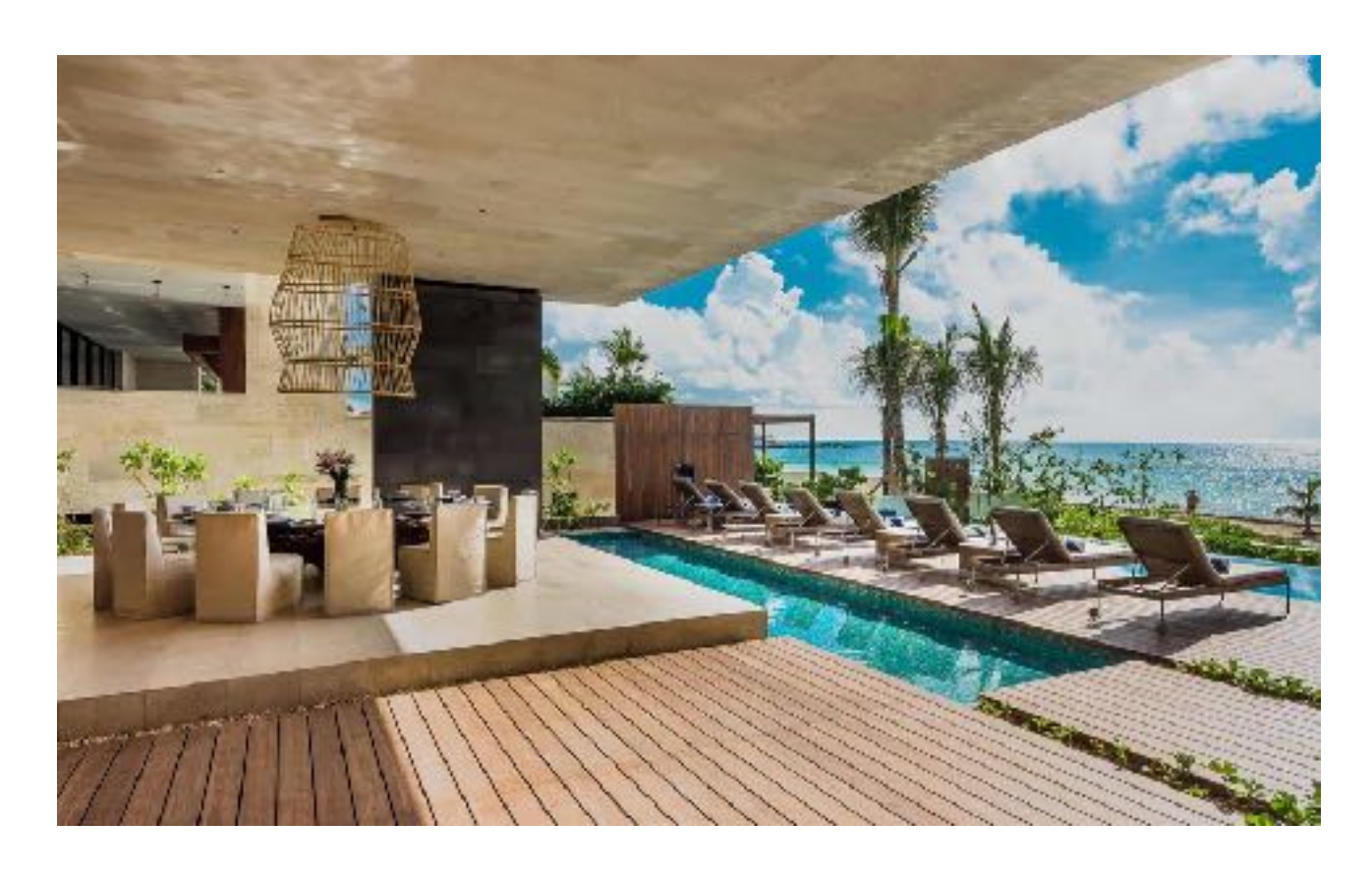
Villa Kin Ich Playa del Carmen Haute Retreats