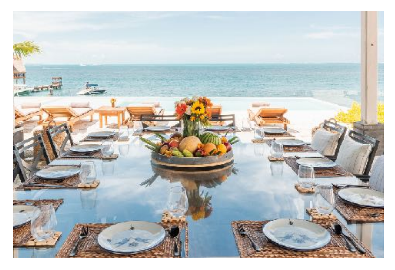
Villa Casazul Cancun Villas by Haute Retreats