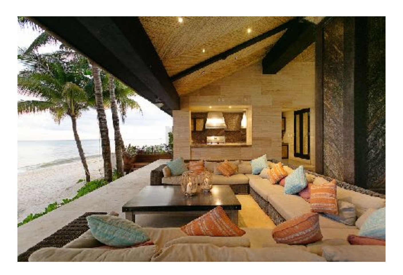
Casa Sirenus I 7 BR I Riviera Maya Villas IHaute Retreats