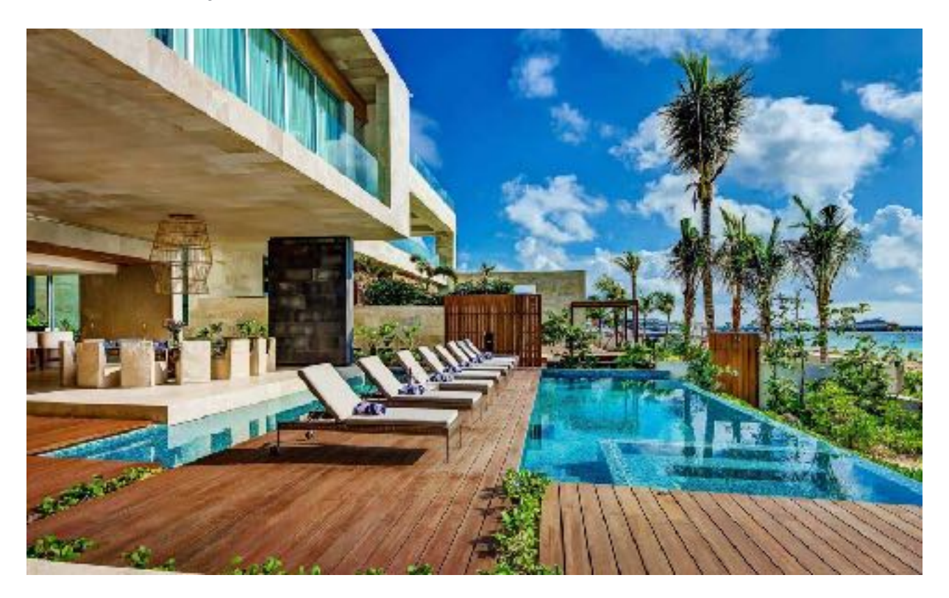
Villa Kin Ich I Riviera Maya

RELATED <u>7 Best Beaches in Riviera Maya</u>