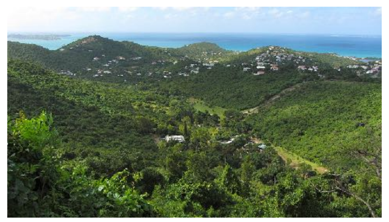
RELATED Our Luxury Guide: St Martin/St. Maarten