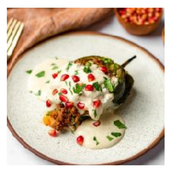
RELATED 7 Tulum Villas with Private Chef Service

Few dishes are as patriotically Mexican as Chiles en Nogada. Chiles en Nogada is made with Poblano chillies; these are stuffed with meat, spices, and fruits to create an incredibly flavorful dish, as a result.