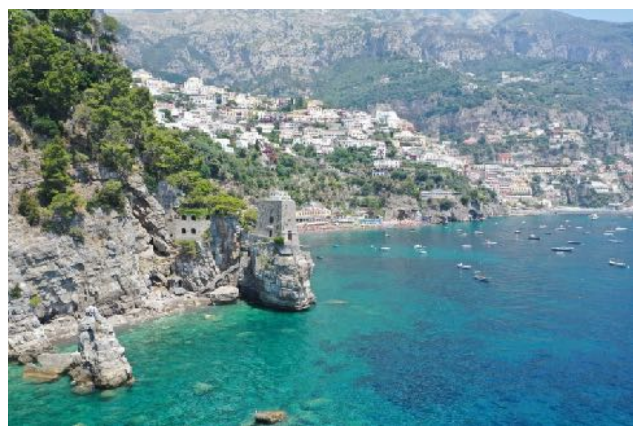
RELATED 5 Things to do in the Amalfi Coast