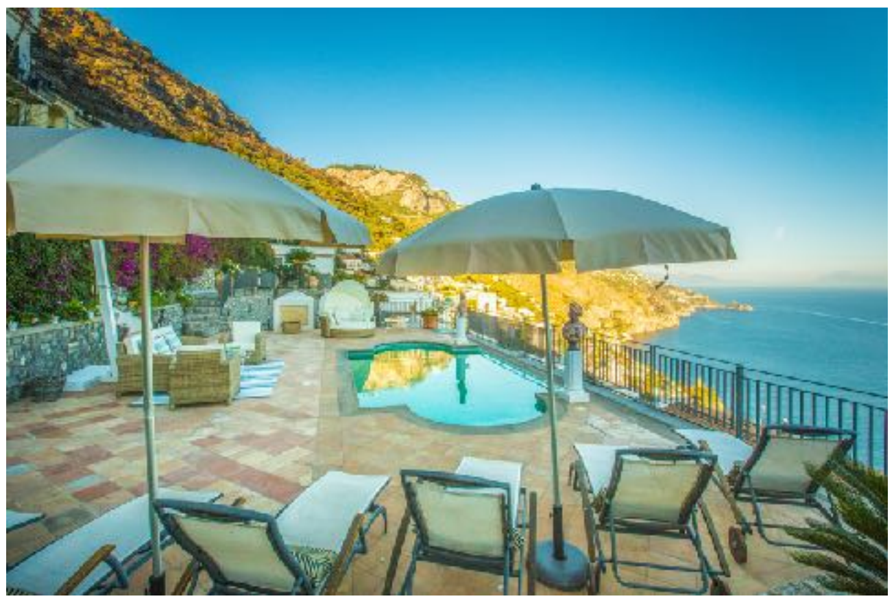
RELATED Michelin-Star restaurants on the Amalfi Coast you should t miss