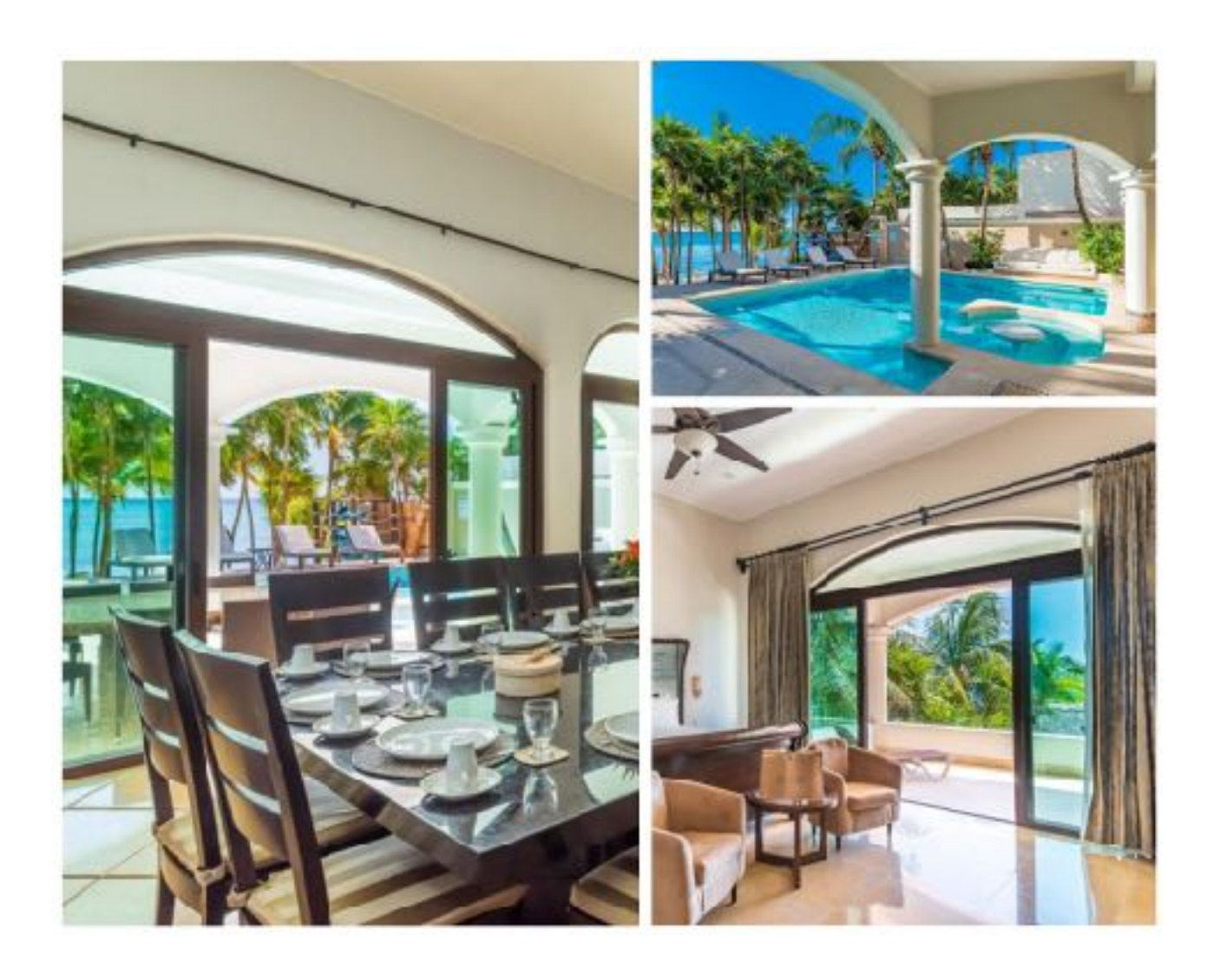
Villa Sueno del Mar in Tulum by Haute Retreats