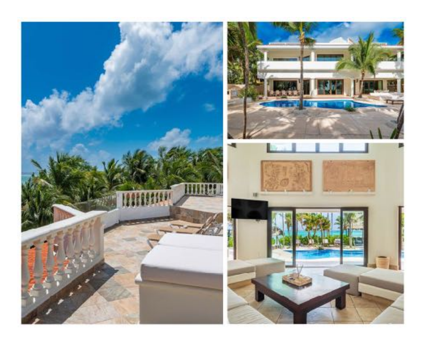
Villa Yardena in Tulum by Haute Retreats